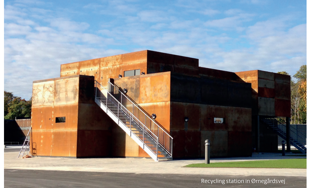
Recycling station in Ørnegårdsvej

compartments, with a separate bin for other waste.