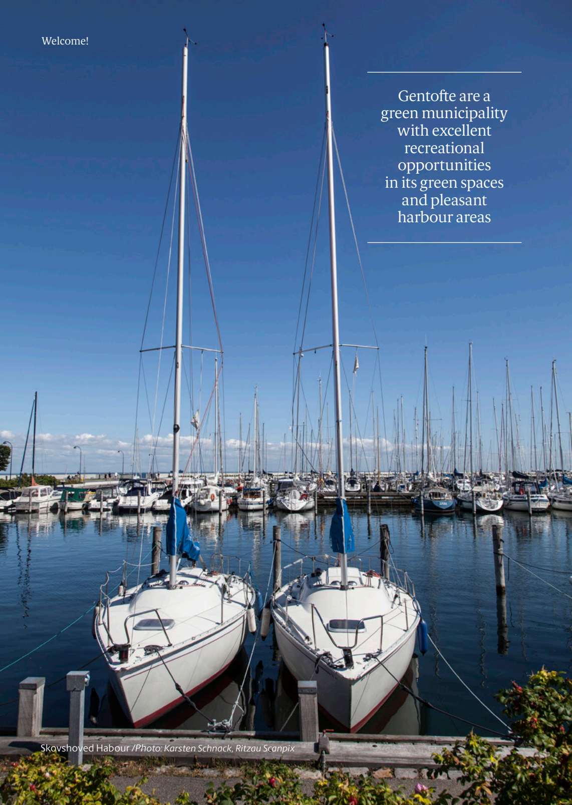
Skovshoved Harbour

Gentofte are a green municipality with excellent recreational opportunities in its green spaces and pleasant harbour areas