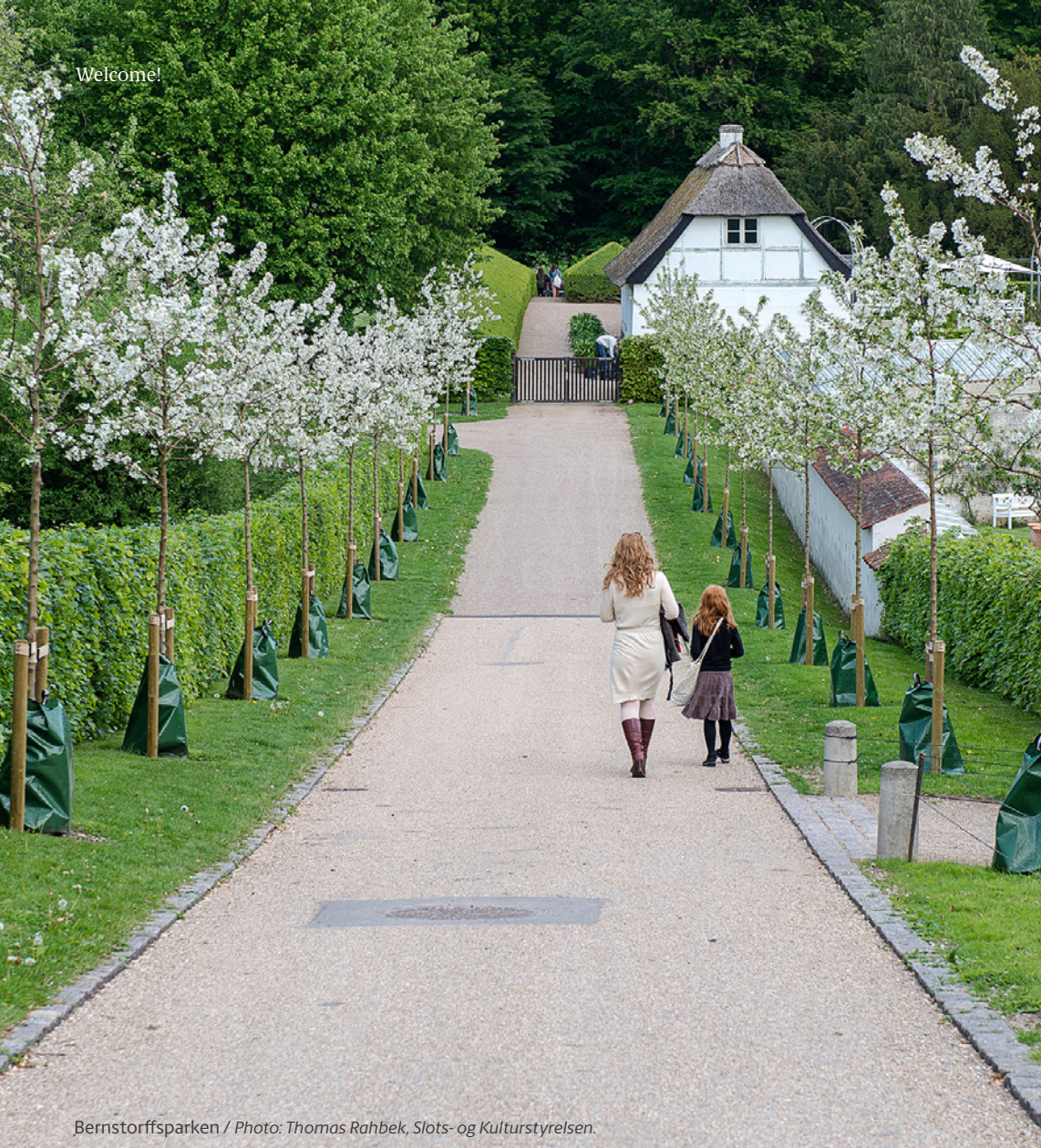
Bernstorffsparken