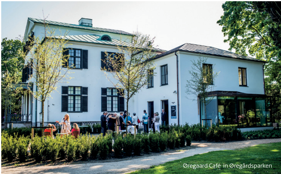
Øregaard Café in Øregårdsparken

Munkegårdsskole is a listed building, designed by Arne Jacobsen, and now boasts